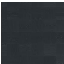
Noble Oak Broadway

The pictures only present the colour of the floor. For more details regarding grading and variations see the Grading Book or www.tarkett.com . Tarkett's international range of floors comprises many different products. Some of these may not be for sale in your country. Although every care has been taken to reproduce images that reflect the finished product, the quality of monitor and printer and the nature of wood results in variations in the color and structure of individual planks.