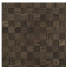
Noble Oak Chelsea