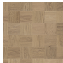
Noble Oak Soho