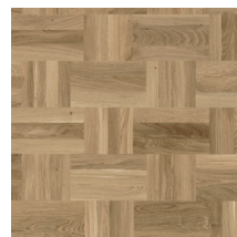
Noble Oak Retro