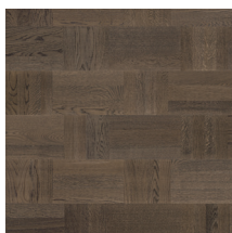
Noble Oak Wasa