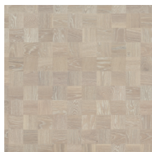
Noble Oak Manhattan