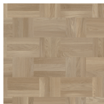
Noble Oak Art Deco