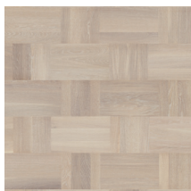
Noble Oak Scandinavia